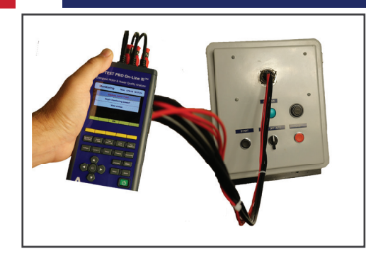
Installed ALL-SAFE inside starter box, connected to ATPOL \ensuremath{\mathsf{III}}^{\ensuremath{\mathsf{T}}} to start taking readings.

The ALL-SAFE PRO® is a permanently installed connection box used with the ATPOL III™. This connection point eliminates the need to open electrical panels when recording motor data. Improves operator safety, simplifies, and expedites the testing process. Eliminates the need for bulky protective gear. Unit connects with 6' cord plug combo to the ALL-SAFE PRO® which is permanently installed inside the electrical cabinet.